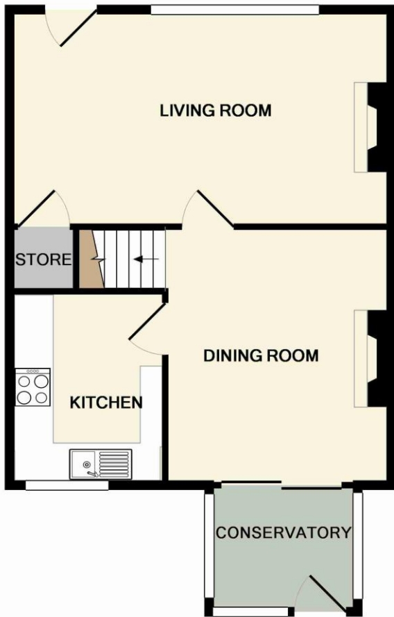
GROUND FLOOR APPROX. FLOOR AREA 517 SQ.FT. (48.0 SQ.M.)